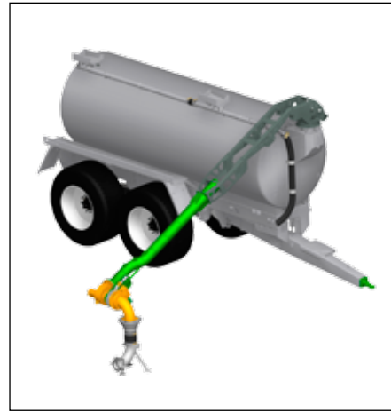
Boom on the funnel