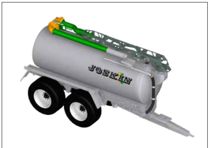
Dorsal boom in folded position - mounted on pivoting point at the front

Non contractual data, subject to changes.