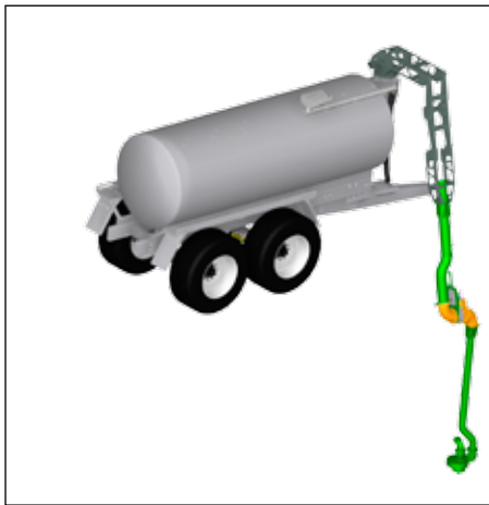
Front boom with submerged turbo