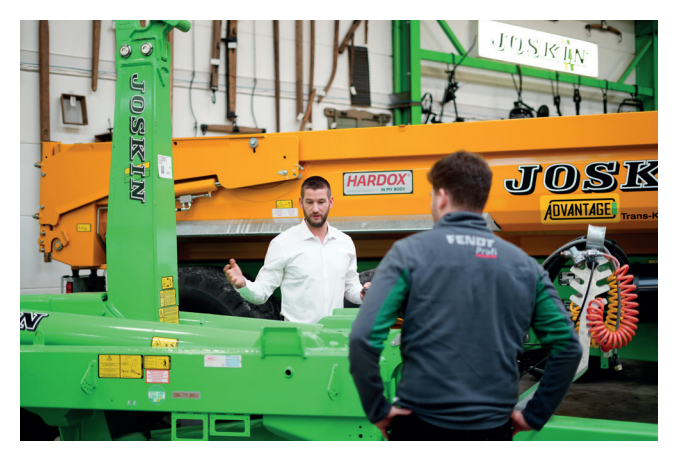
You can now choose your machine without having to go anywhere!

One year ago, JOSKIN announced the official launch of an online configurator for its range of products (https://my.joskin.com/sites/configurator). With this tool, the aim of the Belgian company was clear: to use digital solutions to stay as close as possible to the farmers. Accessible on a smartphone as well as on a tablet or computer, this configurator thus completed a growing range of digital tools dedicated to the company (new website, digital showrooms, virtual tour of our factories, etc.). Through it, JOSKIN wanted to give everyone the opportunity to design its own machine.