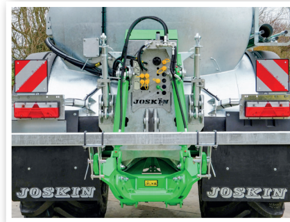
Pre-Equipment for Compact Linkage