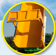
Very large door clearance