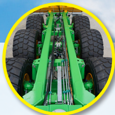
Narrow high tensile steel chassis as an option for a 2.55 m width