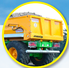
Body and door in HARDOX 450