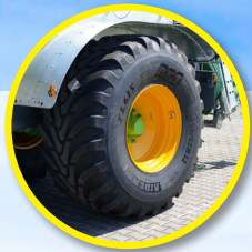
Wheels 800/65R32 with recesses