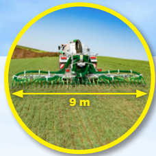
Pendislide START 90/36PS1 line spreading boom with skids