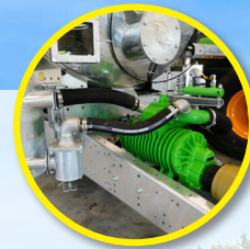
Vacuum (11,000 l/min) or spiral pump (3,666 l/min)