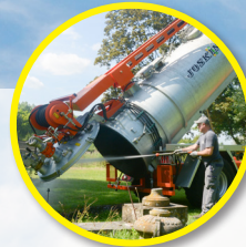
Tipping tank with hydraulic full opening rear door