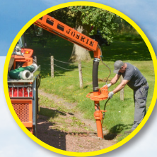
Counterbalanced manual Ø 4" dorsal boom