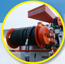
50 m cleaning hose (3/4")