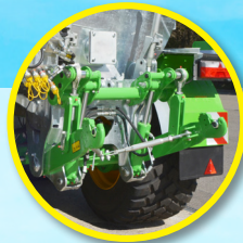
Integrated linkage and "Automaton 2+4" hydraulic equipment