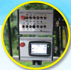
Control box in the cab + Touch-Control screen

Equipped for Various Spreading Implements (booms and injectors)