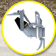
Spreading with exact scatterer