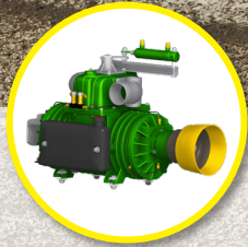
Autonomous filling and emptying with a vacuum pump