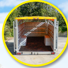
17 cm reclining system • Full-opening rear doors