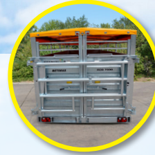
Choice of fences: • Pivoting • Rail-mounted • Telescopic