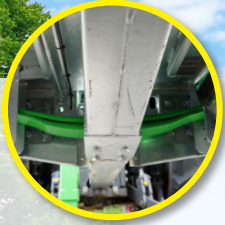
Cross-suspension drawbar with parabolic leaves