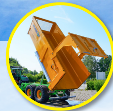
1-part hydraulic door with rubber seal and hydraulic rams integrated into the door arms