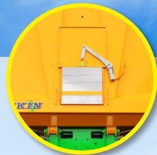
Central grain chute (500 x 500 mm)