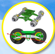
Roll-Over suspension to facilitate traction in difficult conditions