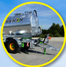
Tetrainer: Dolly and air suspension