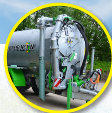
With or without filling arm