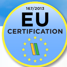
34 t certification