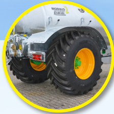
Recessed wheels: 800/65R32