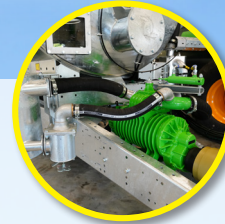
11,000 l/min pump • Ecopump • Ø 150 mm valve