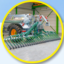
Pendislide BASIC 75/30PS1 line spreading booms with skids