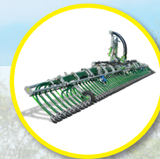
Pendislide PRO 120/48PS2 line spreading boom