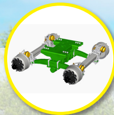
Roll-Over bogie with free-steering axle