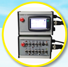
Electrohydraulic control with Touch-Control