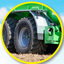
Trelleborg 750/60R30.5 with tyre inflation system