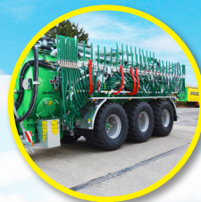
30 m spreading boom