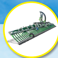
Pendislide PRO 150/60PS2 verspreidingsboom van 15 m