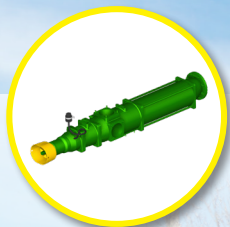
Pompe colimaçon 4 500 l/min